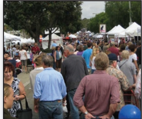
Carlsbad, California. How many of the 110,000 people do you think are lost? If we don't tell them how to be saved, "Who will?"

The state of the economy has had a devastating effect on giving to this ministry. Please consider financially helping with the many expenses associated with these outreaches. May God bless you and your family this Christmas Season as you diligently strive to serve Him.