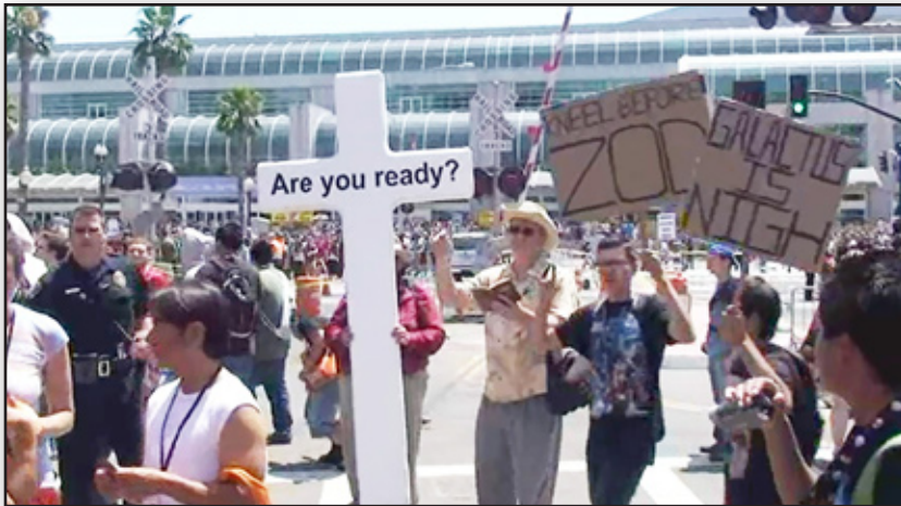
130,000 people attended ComicCon. Many saw our 8 foot cross and heard the gospel. I'm reading from Hebrews 9:27 while these youngsters mock the message. There was a considerable mocking and defiant crowd. This seems to be a growing trend as a rebellious world becomes more blatant in their hatred for God and the gospel.

Just after this I spoke with a man that appeared homeless. He said he was a Christian. He spoke very slowly with few words but so precise and beautiful that I felt unusually close to the presence of God. As if he were sent for encouragement to me. What a blessed conversation we had of our Great God and Savior that I will never forget.