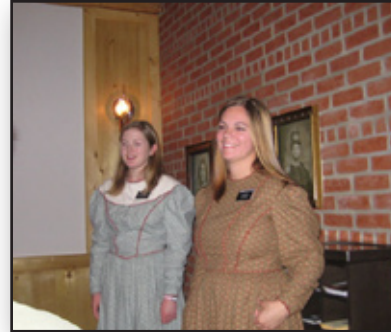
These were 2 lady LDS missionaries at the Battalion giving our tour. I spoke to a different lady missionary about 15 minutes about the seriousness of LDS doctrine. She seemed genuinely troubled over what I shared with her.