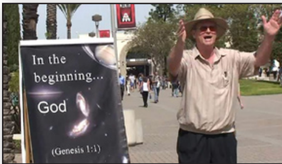
Here am I presenting the Gospel at San Diego State after refuting evolution and giving powerful evidence for the Creator, the God of the Bible. I posted the video on the internet and have had many emails and dialogues about creation and the gospel.